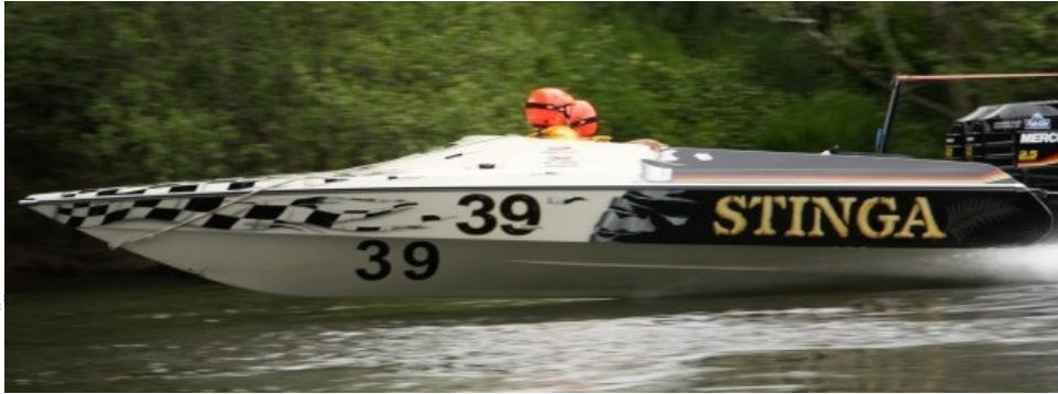
ZL1DK enjoying himself in the sweep boat.